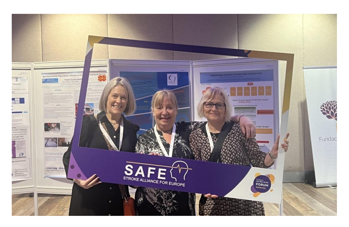
The SAFE team 🈊