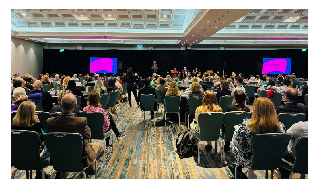
328 registrations and 316 attended the one-and-a-half-day event. Our delegates included stroke survivors, carers, stroke support representatives, researchers, students, physicians and allied health professionals.